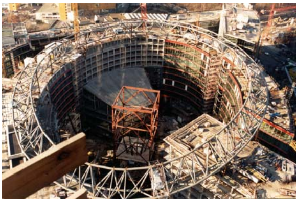
Fig. 1: Roof top steel frame under construction placed onto building structure. Spherical up-lift-load bearings set between steel frame and building structure.