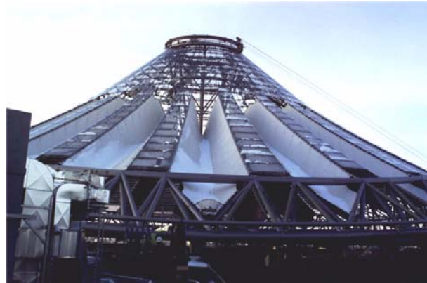
Fig. 2: Finished roof top. Steel frame on photo bottom is set onto spherical up-lift-load bearings.