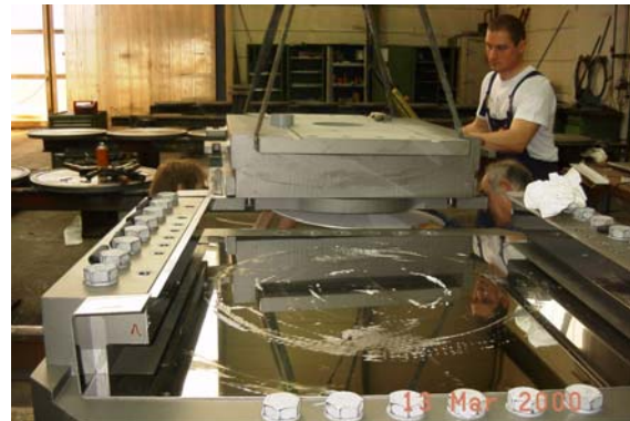
Fig. 4: The package spherical part + bearing bottom or middle section resp. is pushed up-side-down (better assembly!) into the external claws fixed to the top sliding plate also lying up-side-down.