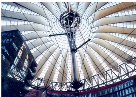
Fig. 3: Roof top steel frame and roof top from inside