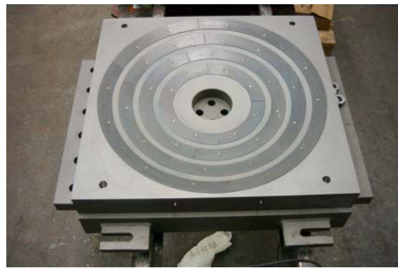
Fig. 2: Bearing bottom or middle section resp. where the spherical part is fixed onto. The concave surface is fitted with a special sliding partner sliding against the chromium plated surface of the spherical part.