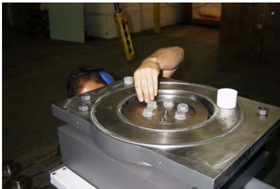
Fig. 3: The spherical part is set onto the bearing bottom or middle section resp. and fixed by the rotation up-lift device set through the hole of the spherical part.